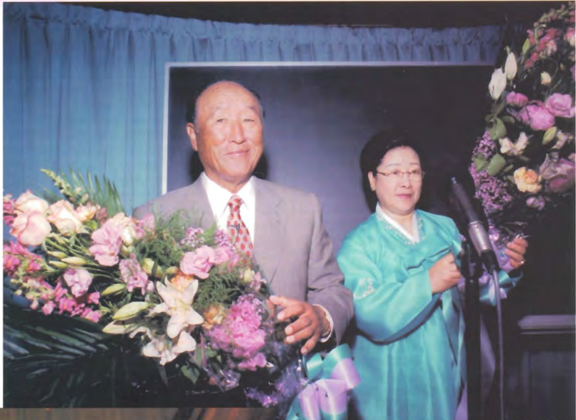
True Parents receive flowers prior to the morning speech at Belvedere