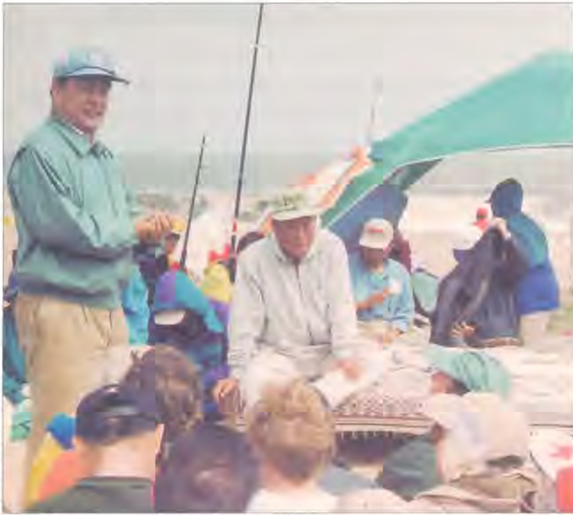
Father gives leaders training in surf fishing at the beach in Punta del Este on January 3, 1998.

not know that they are descendants of fallen ancestors. Therefore, they do not know how to grieve over this fact. This is han. People sigh when they listen to the Principle, saying, "We did not know the truth because the world became this way."