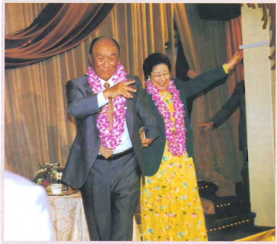
TRUE PARENTS BID FAREWELL TO THE AUDIENCE AT THE MANHATTAN CENTER AT THE CONCLUSION OF THE CELEBRATION OF TRUE DAY OF ALL THINGS. MAY 26, 1998.

“Who is this God? He is our Father. He is our subject of love. He is to be the Father of our family, our tribe, our nation and our world. The one who could be the Father of heaven and earth is the God who is the subject of all. Because human beings were created as the objects of God’s love, when the first human ancestors fell, God lost His partners of love.”