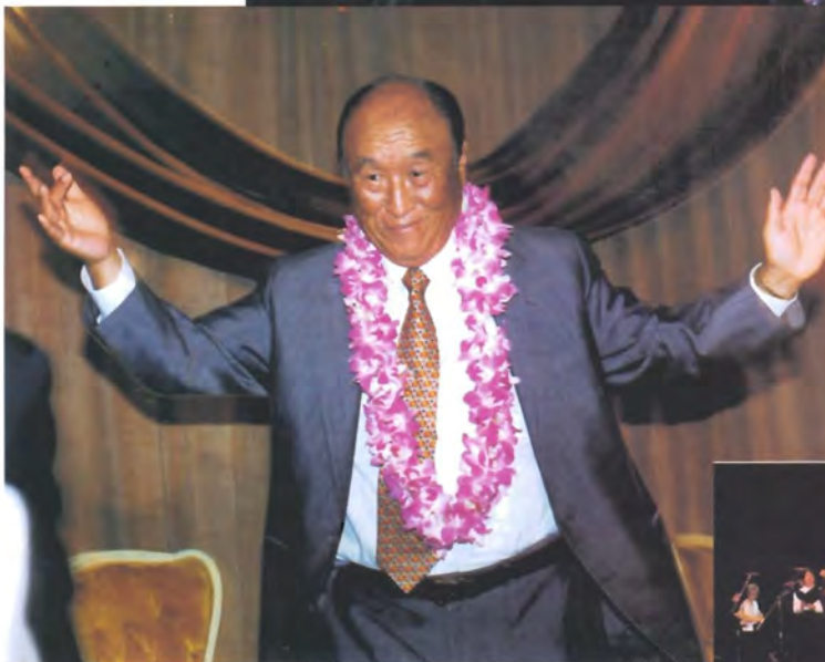
Father bids farewell to the audience attending the evening performance held at the Manhattan Center's Hammerstein Ballroom.