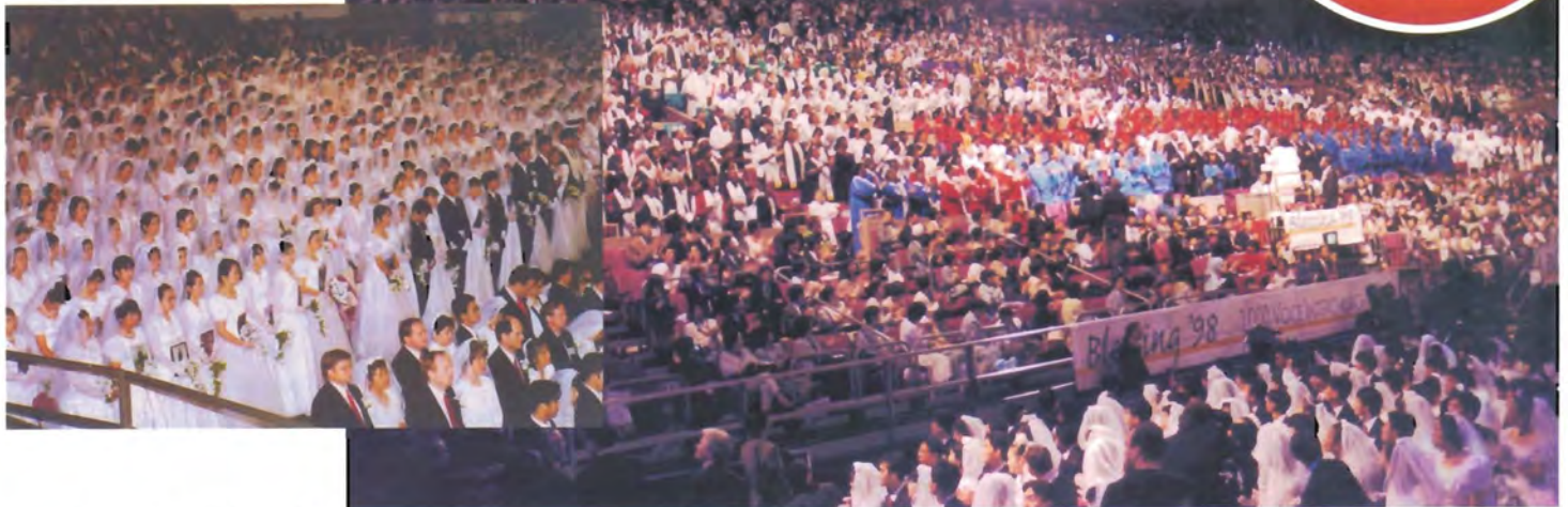
(Above, l.) Brides with pictures of bridegrooms; (above, r.) 2,000-voice choir performs one of five hymns that accompanied the Blessing ceremony.