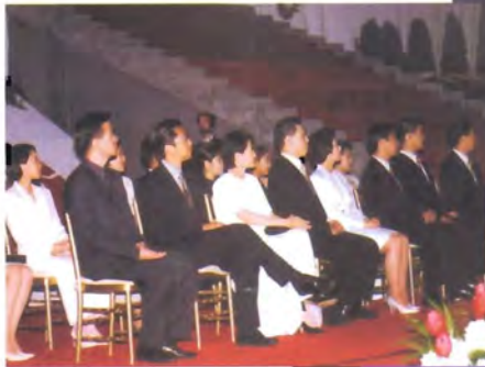
(Above, center) True Parents prayer of blessing for all couples; (above) members of True Family; (r.) view of Madison Square Garden main ceremony being transmitted simultaneously via satellite worldwide.